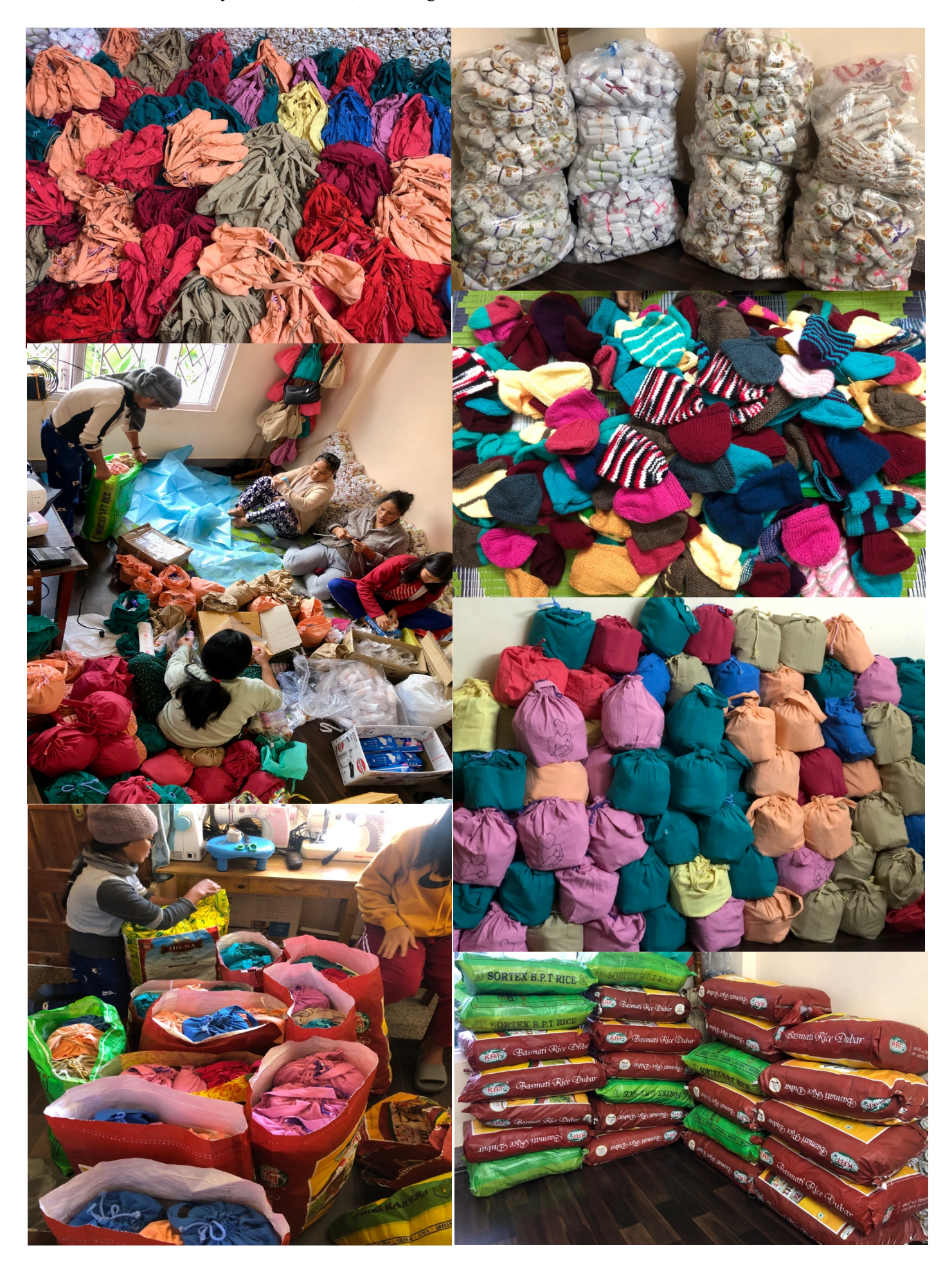
The Items of Current CDK Contains: Reusable cotton Bag, Swaddle, baby blanket, Baby hat, Reusable Baby Nappies, Anti-bacterial Soap, Latex Gloves, Sterile Cord clamps, Sterile Blade, Baby oil, Baby Powder, Multi-purpose Plastic Sheet, Iron and Folic Acid, Sanitary Pads for women, CDK usage Instruction note.